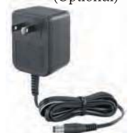
AC Adapter (Optional)

A&D Australasia ACN 26 007 556 809 Head Office 32 Dew Street THEBARTON South Australia 5031 Telephone (08) 8301 8100 Facsimile (08) 8352 7409