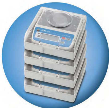
Stackable Carrying Case (Standard)