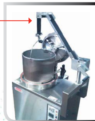
Gantry lifting system