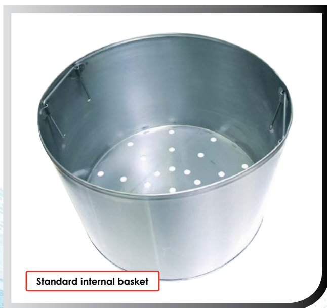
Standard internal basket

The electrical supply required is either 15AMP or 20AMP single or two phase, which may be plugged or hard wired directly to electrical supply. No special plumbing is required but the vents may be plumbed to a suitable drain to avoid steam exhaust in the autoclave location.