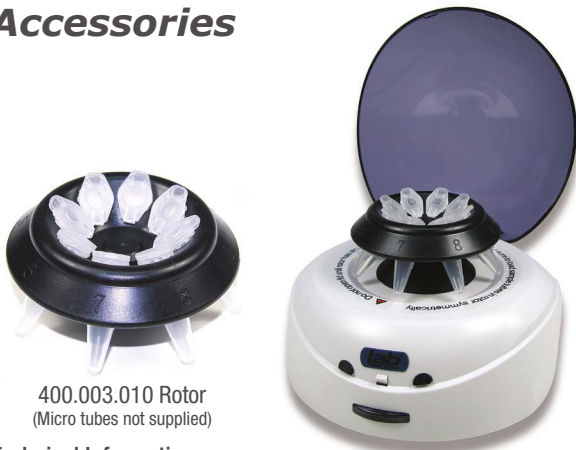
400.003.010 Rotor (Micro tubes not supplied)