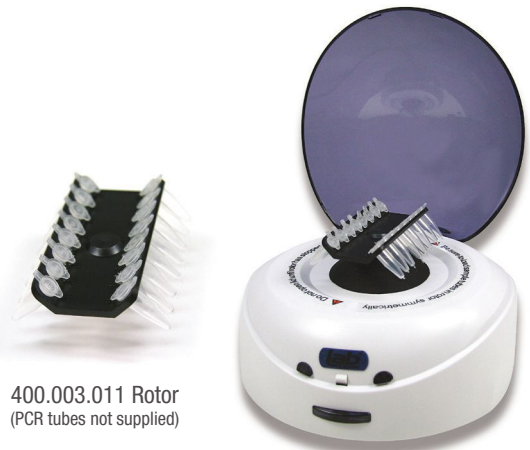
400.003.011 Rotor (PCR tubes not supplied)