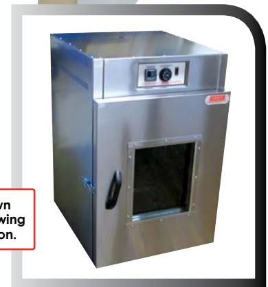
Model shown with glass viewing window option.

Controller – A digital microprocessor based PID temperature controller controls the temperature within the range ambient +5°C to 200°C, temperature fluctuation at 105°C is \pm 1^\circ\text{C} .