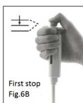
First stop Fig.6B