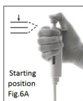
Starting position Fig.6A