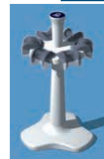
Freely rotatable stand for handy storage of Transferpette® S and Transferpette® S -8/-12 pipettes