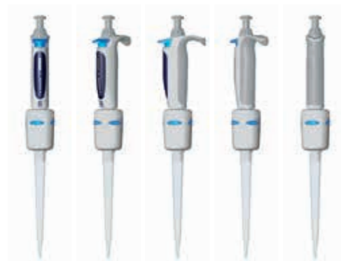
Transferpette® S 10 ml