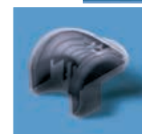
Shelf-rack mount for a single Transferpette® S pipette