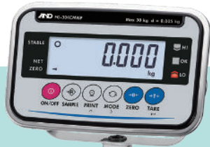
M-size platform (30 kg)