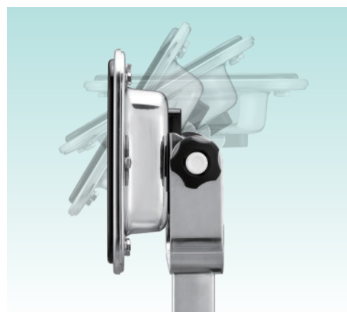
Freely adjustable display angle