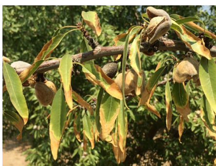
Figure 2: Leaf-tip Burn in Almond Orchard

Electrical conductivity (EC) is the method used to measure soil salinity, which is influenced by the concentration and composition of dissolved salts. Salts increase the ability of a solution to conduct an electrical current, so a high EC value indicates high salinity. The LAQUAtwin EC 11, 22 and 33 conductivity pocket meters measure electrical conductivity in drops or micro-volume samples and display reading in just few seconds. The replaceable sensor is made of two flat titanium metals coated with platinum black that resist corrosion. The meters are programmed with standard recognition function for automatic calibration and automatic temperature compensation (ATC) function for accurate measurement.