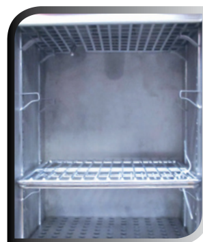
VO6 oven inside