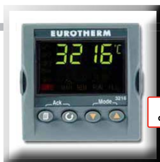
PID Control display system

Controller – An analogue gauge up to -100KPA displays chamber pressure and a digital microprocessor based PID temperature controller controls the temperature.