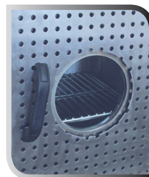
Optional viewing window