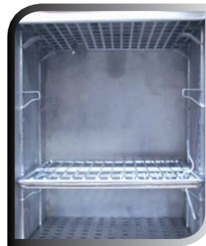
VO6 oven inside