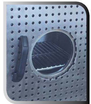
Optional viewing window