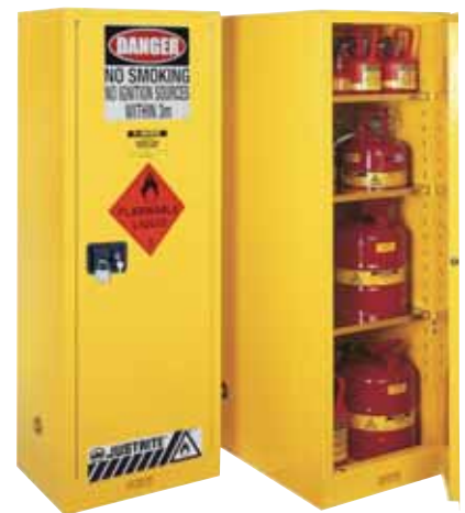
AU25304 / AU25308